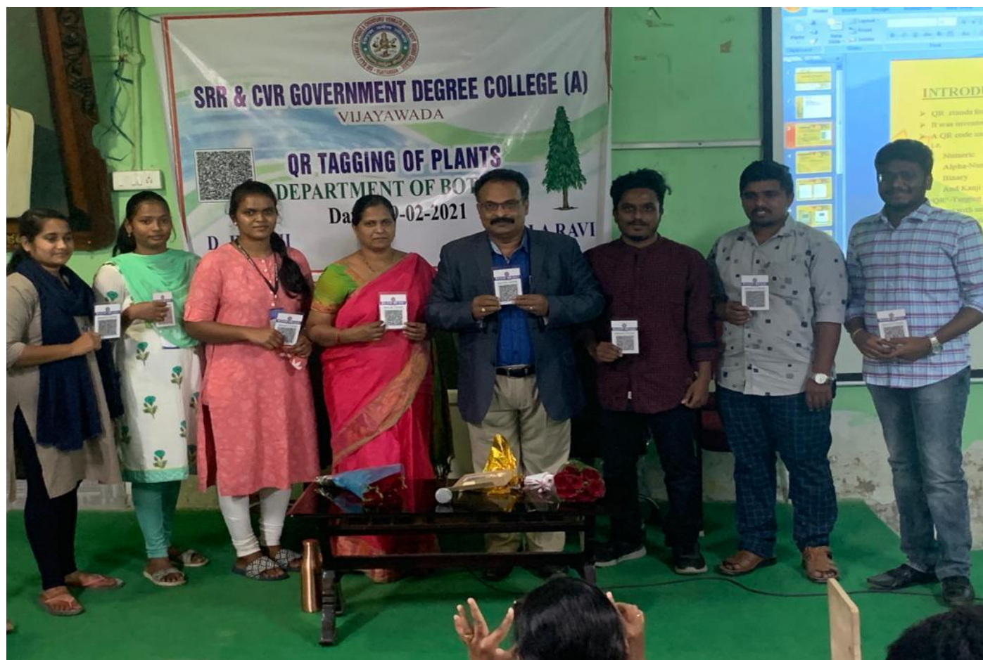
Honourable Principal, Staff and students exhibiting QR Codes