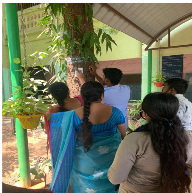
Department of Botany Faculty and students Tagging Trees in the college campus.